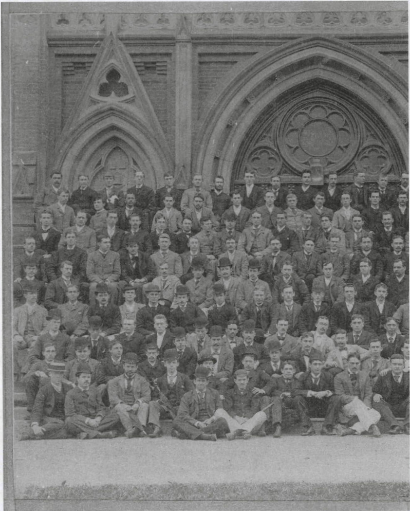
Figure 1: University of Berlin students, ca. 1894.